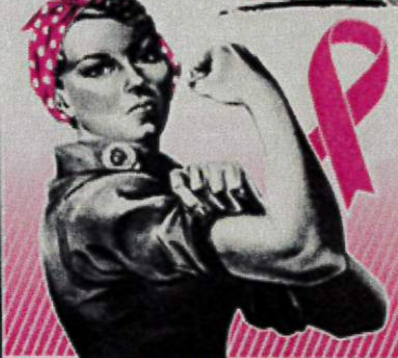
American Postal Workers Union Alamo Area Local #195

To honor our Veterans this Veteran's Day the Local is giving away FREE "NEVER FORGET" Veterans T-shirts to all veteran APWU members who attend the October General Membership Meeting.